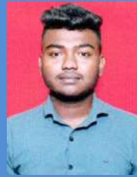
Raste Abhay Bharat

SIP Title: Study of sourcing process of talent at bajaj allianz general insurance