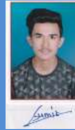
Borse Sumit Bharat

SIP Title: A Study based on Training Need Analysis of employees