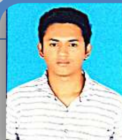
Chavan Vishal Vishnu

SIP Title: A study on equity analysis of indian it sector