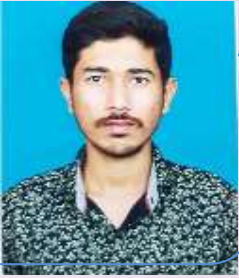
Phad Pratik Vikas